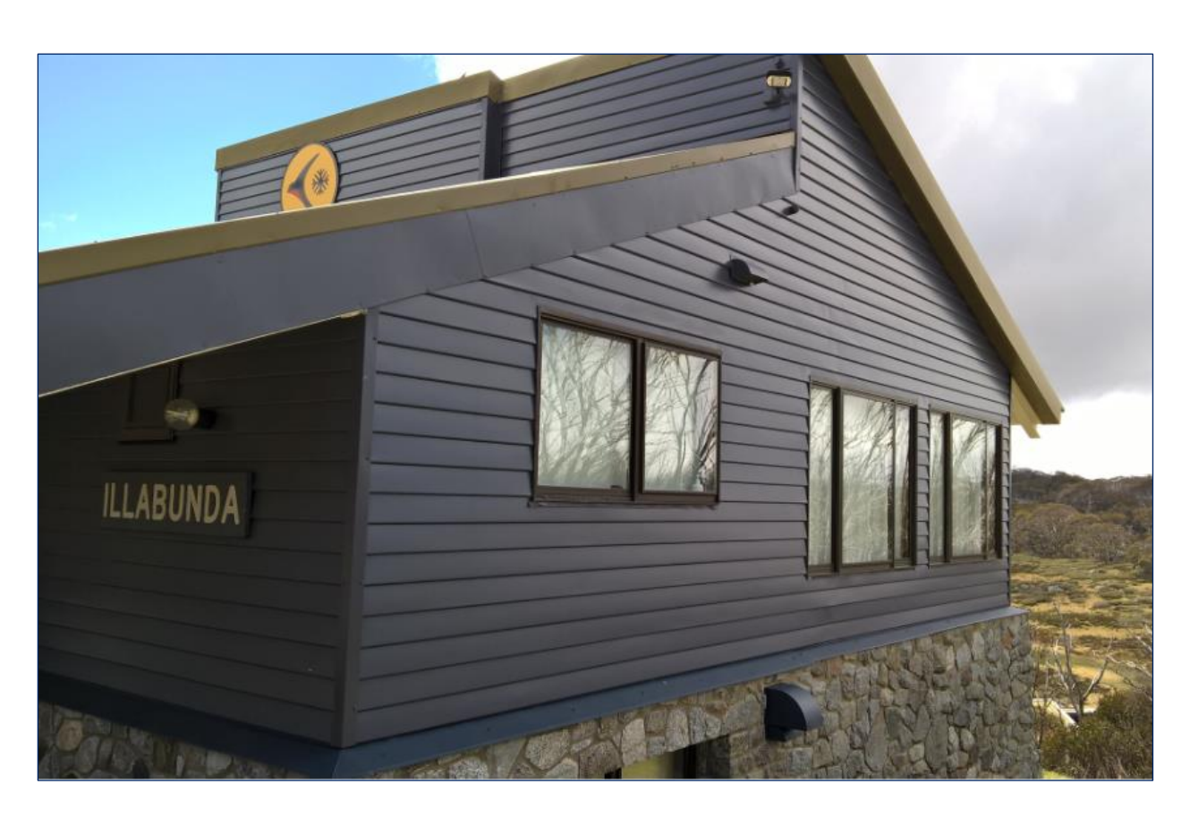
Figure 2 | External photograph of Illabunda Ski Lodge