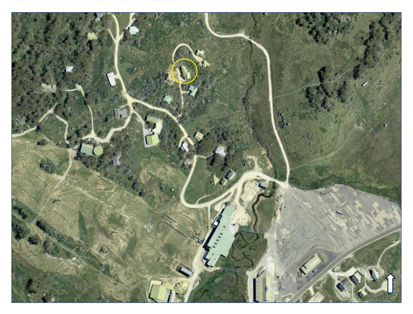
Figure 1 | Site in context of Perisher Valley

There is native vegetation within the Lot, some of which is was reduced during the 2014 application for the recladding of the building. The land outside of the lease is charactered by native vegetation which provides habitat for native animals. The site is accessible from Telemark Place.