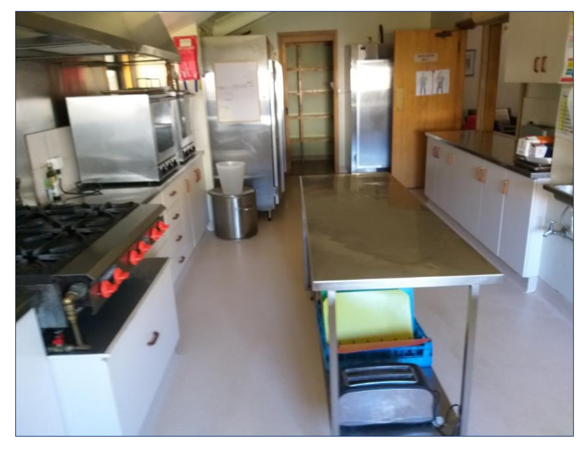
Figure 3 | Existing commercial kitchen